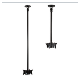
Available in two separate lengths that can be cut to desired size