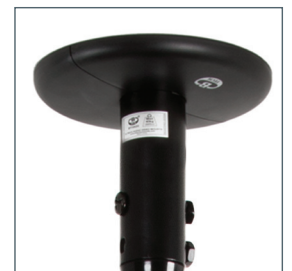
BT5820-CP Cover Plate available separately for a smarter installation