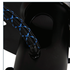
Integrated cable management